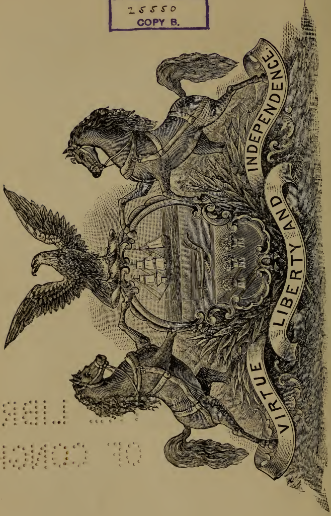
COAT OF ARMS OF THE STATE OF PENNSYLVANIA.